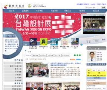
Tainan City Government official homepage