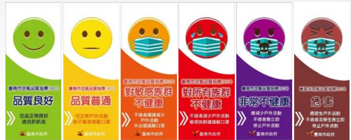
Environmental Protection Bureau of Tainan City Government air quality flag