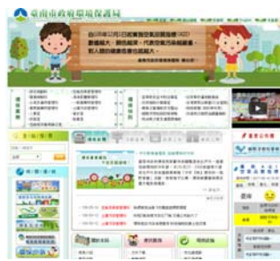
Environmental Protection Bureau of Tainan City Government official homepage