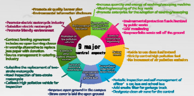
PM 2.5 Pollution sources and control strategies in Tainan City